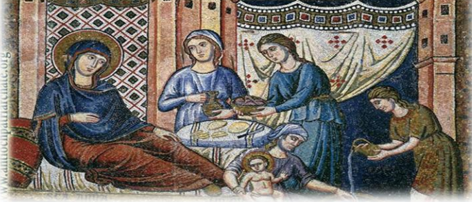
The Nativity of Our Most Holy Lady the Theotokos and Ever-Virgin Mary