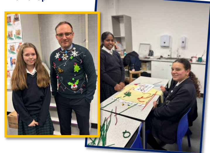
A big thank you to everyone who joined us for a fun and creative Christmas jumper workshop! From glitter to pom-poms, the unique designs everyone came up with were truly amazing.